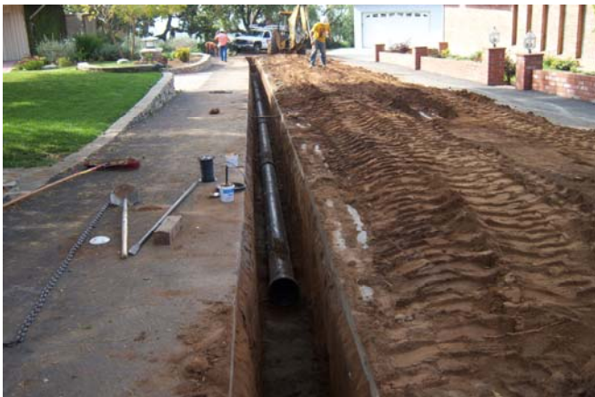
Installation of a New Pipeline on Doyme Road

The $400,000 project on Kinneloa Mesa included 2,644 feet of new larger pipelines, five new fire hydrants, five upgraded fire hydrants and 12 new street valves.