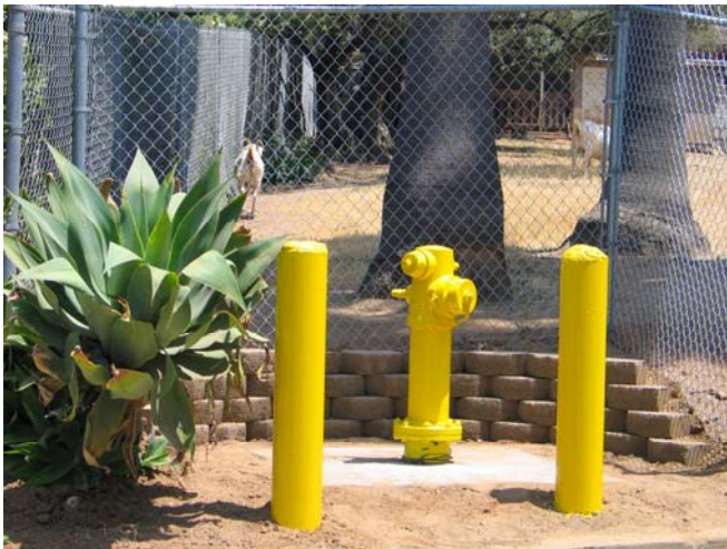
New Fire Hydrant on Lindaloe Lane

The District's Board of Director completed a Water Master Plan in 2000 to address the growth in our service area and many of the issues and deficiencies that were identified after the firestorm in 1993. The plan which is periodically updated contains more than 20 projects designed to improve our ability to provide water when fires, natural disasters and other emergencies strike our area.